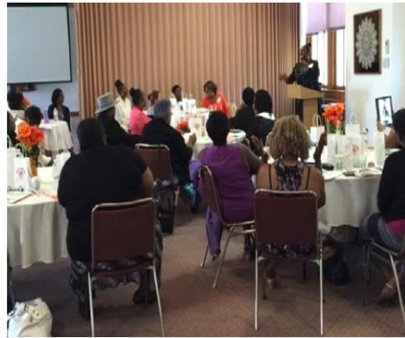
The Women Came to Receive!