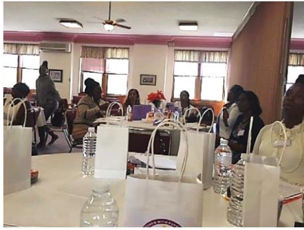
God Brought Us Together